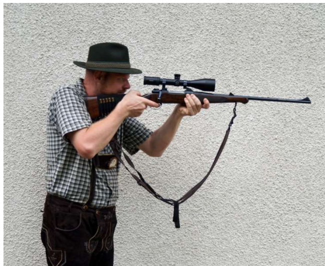
Standing free with handgun and rifle