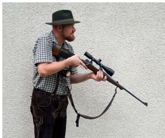
standby position with rifle