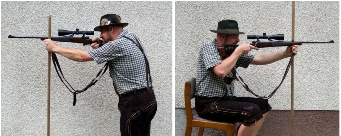
Standing and sitting „supported“ with stalking stick

The shooter is sitting and the stalking stick is completely free and must not be supported on the chair or in any way anywhere else.