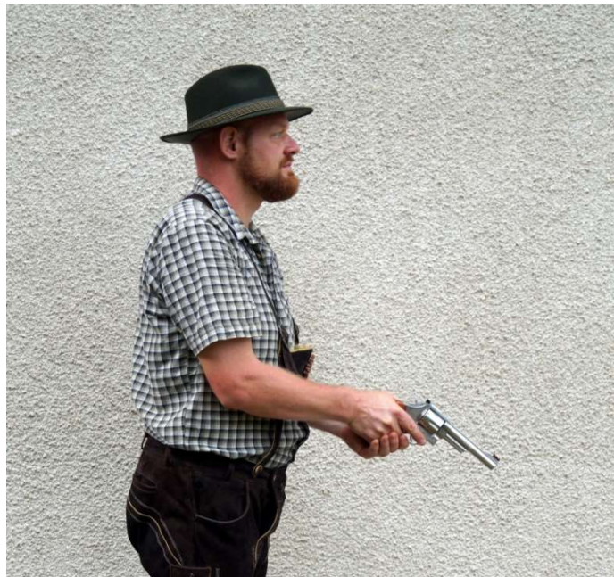
Standby position with handgun

The single-handed handgun disciplines can be shot independently without time pressure. Only 5 rounds may be loaded at a time and the weapon may not be set down or removed from the target after the first shot has been fired.