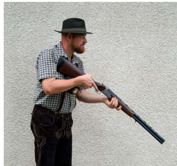
"Standby" position with shotgun